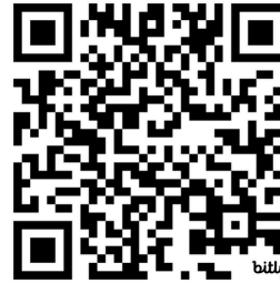
LARC K12 Key Talent Providers