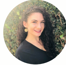
Senior Specialist, Regional Partnerships