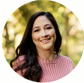
Regional Apprenticeship Manager