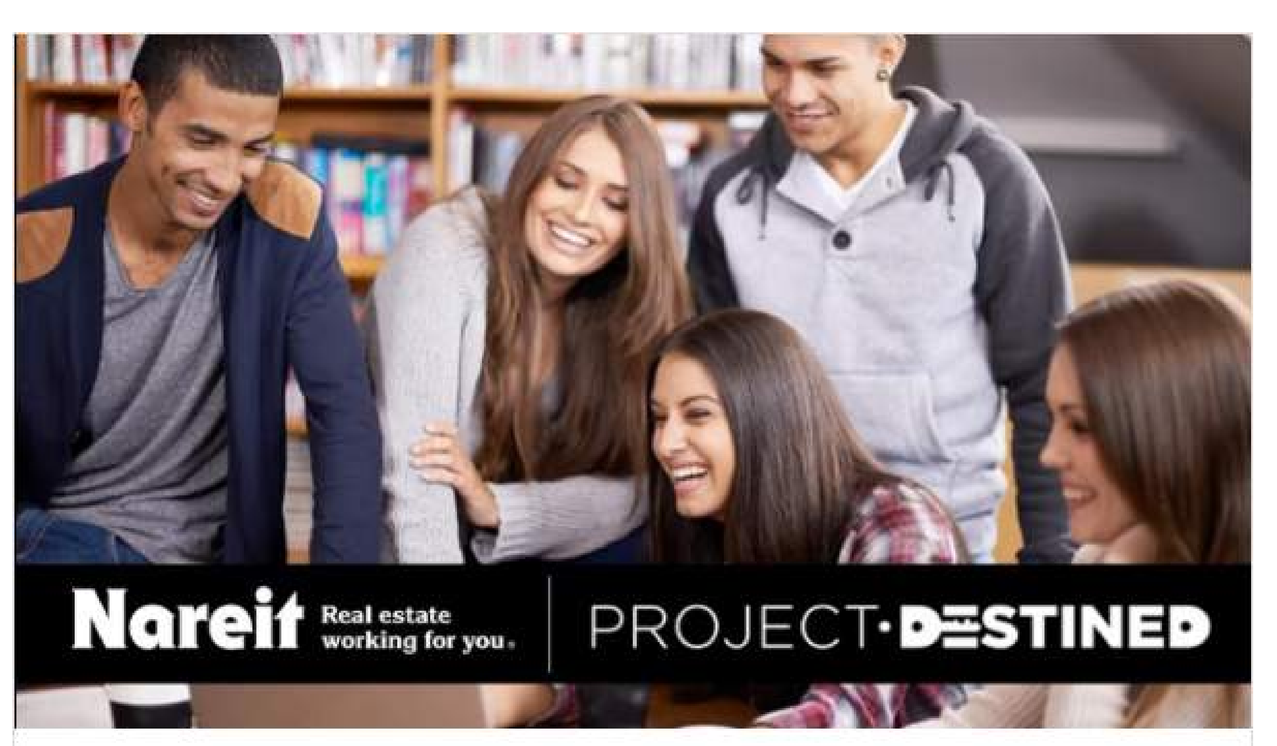
Summer REIT Interns Share Value of Work Experience N reit.com

We're leading the publicly traded real estate industry with engaging social practices and robust alliances. Last year we collaborated with NAREIT and Project Destined. Hear what some of our interns had to say in this featured article!