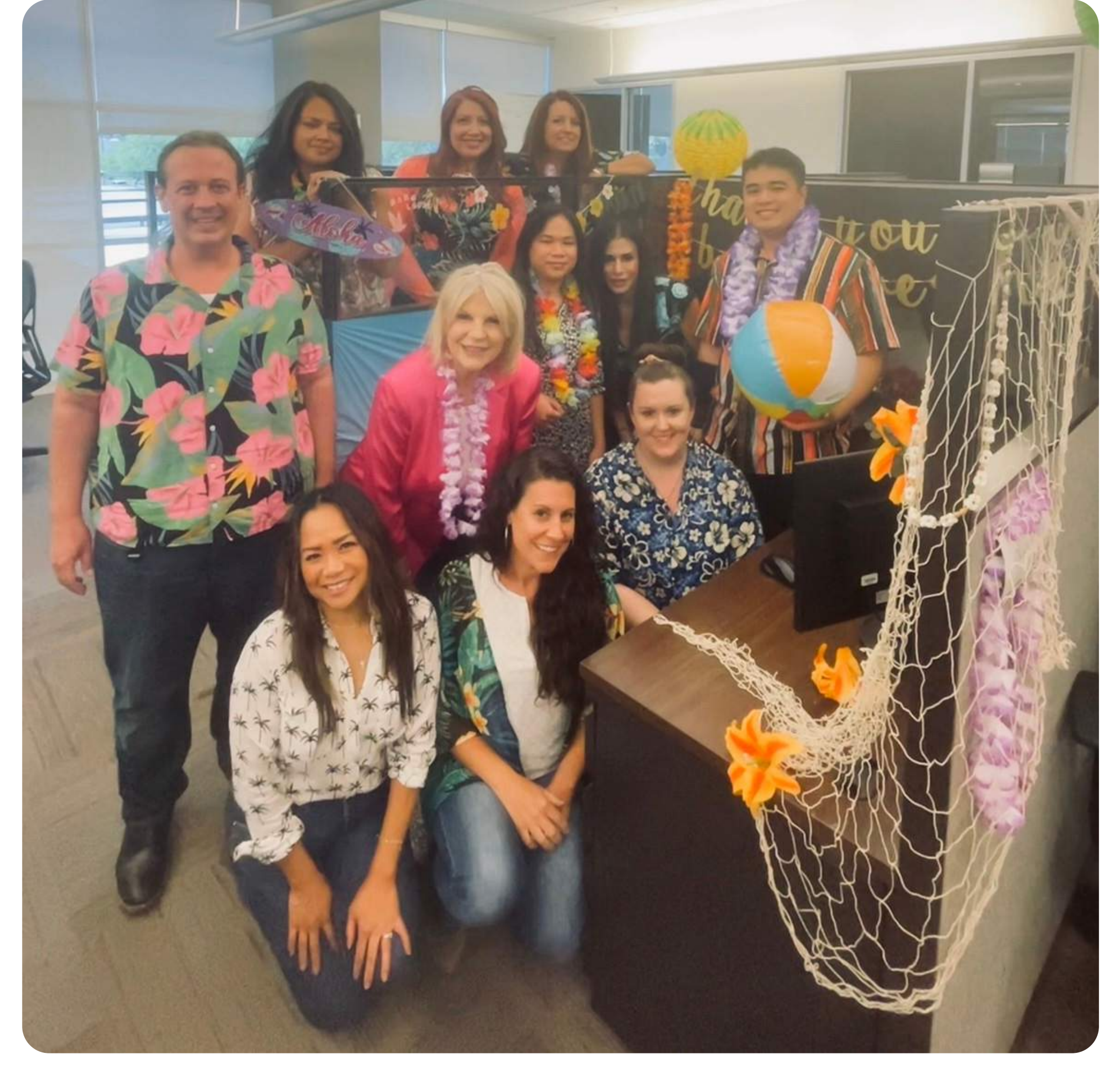
Our Talent Acquisition team of recruiters and specialists are in search of top talent!